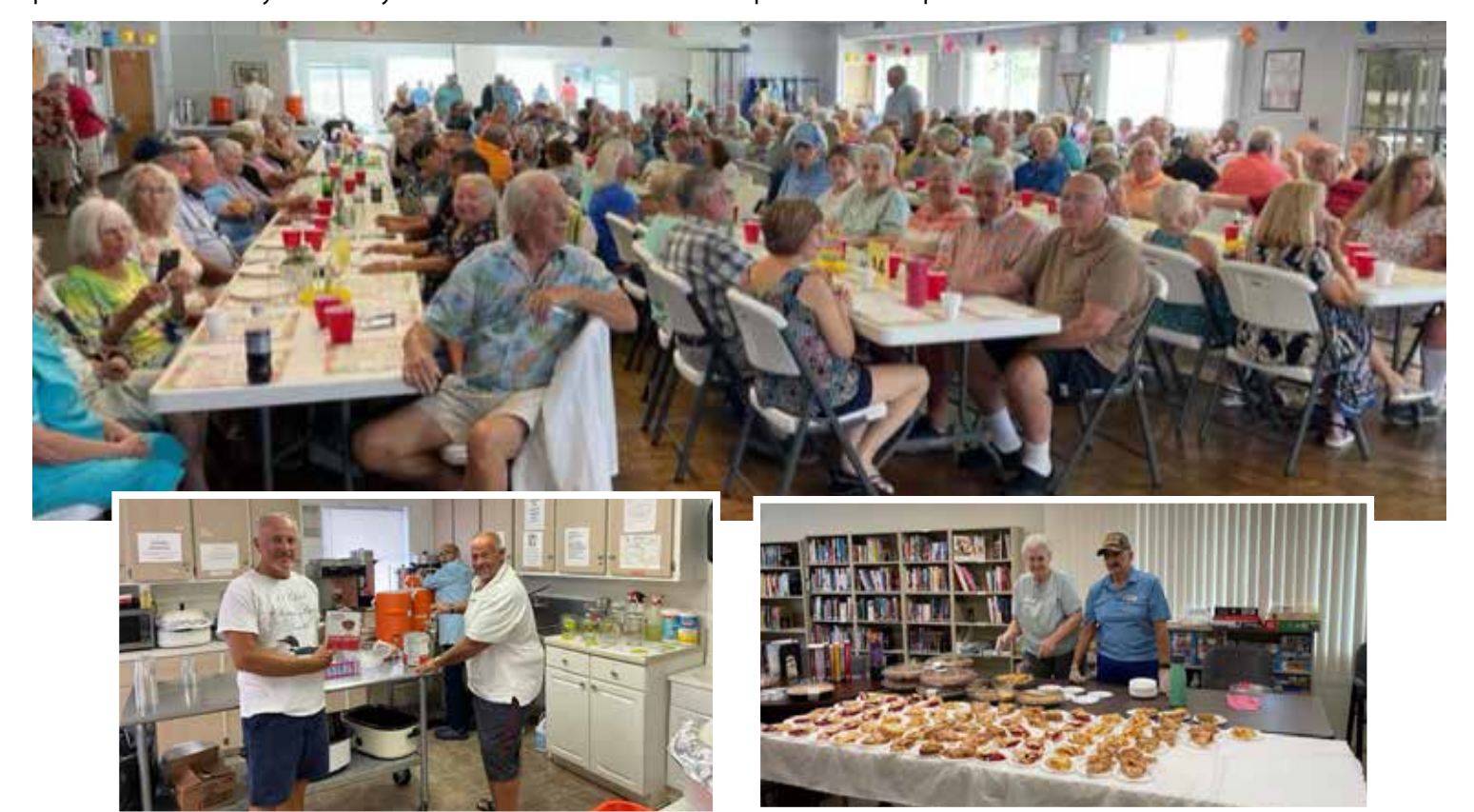
May/June 2023 - Village on the Greens Chatter - Page 13

At one o'clock in our Clubhouse on Easter afternoon, a wonderful Easter dinner was served to around 220 people. The special event was run by The Caswells and the Manors. The menu included Easter ham, scalloped potatoes, sweet potato casserole, coleslaw, rolls, and pie for dessert. Thank you to everyone who attended. Here are a few pictures of our special event: