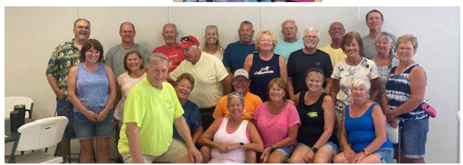
May/June 2023 - Village on the Greens Chatter - Page 7