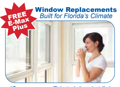
"Our new energy efficient windows installed by AMS are beautiful. Everything from start to finish was great."

The Very Best In: Window Replacement, Aluminum Roofovers, & Enclosures