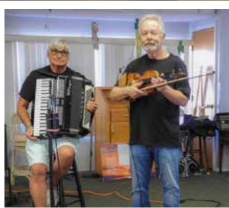
(continued on page 13)